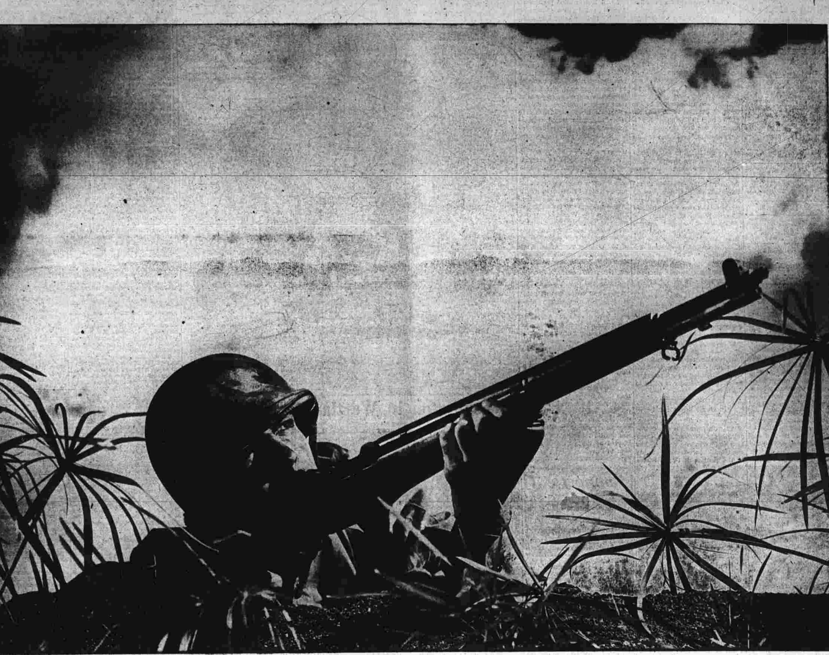
Incidentally, the movie men were doing any laughing either, when up out of one of the boats popped a reporter in civilian clothes, hoisted his trousers and waded stock-like and anything but Marine-like directly into range of their camera.

They had heard none of the bloodthirsty yells credited to the Marines by the movie, for the American sea dogs don't go in for that outmoded technique of trying to hold the beach of dunes beyond from this particular landing party—or any other military unit trained against a tough proposition.